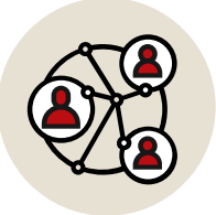
Public health workforce & infrastructure

BCHC advocates for investment in public health infrastructure to build communities where everyone has optimal environments and opportunities for health. BCHC prioritizes supporting our public health system in the following areas: