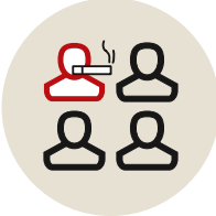
Chronic disease, including tobacco