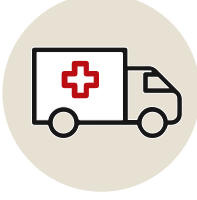
Emergency preparedness & response