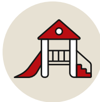
Community safety & violence prevention