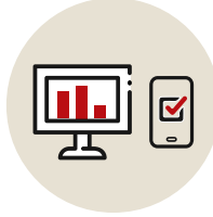
City-level data modernization