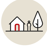
Racism, health equity & social determinants of health