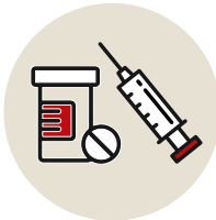
Substance use, including opioids